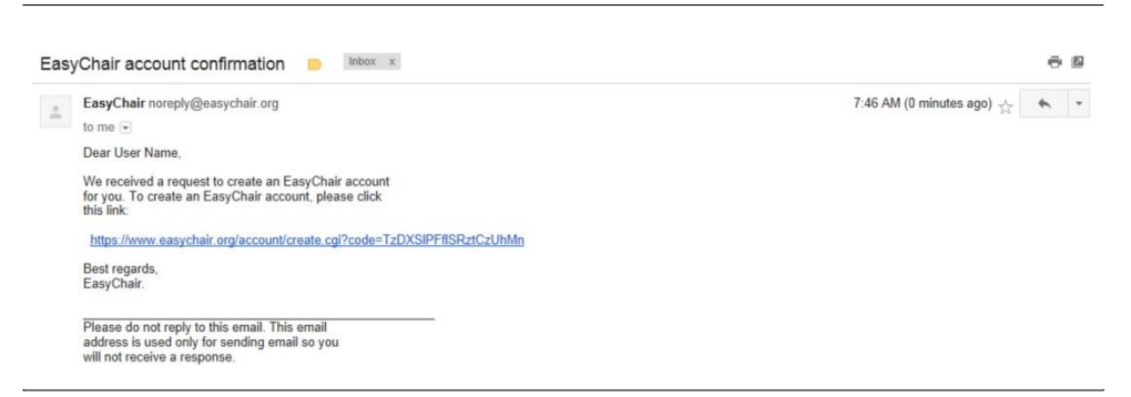
Figure 3: Login email.

After registering, you will receive an email similar to the one in Figure 3. Use the link provided in the email to continue the account registration process.