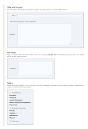
Figure 8: Abstract submission.

Fill out the text abstract, keywords and the related topics (as shown in Figure 8).