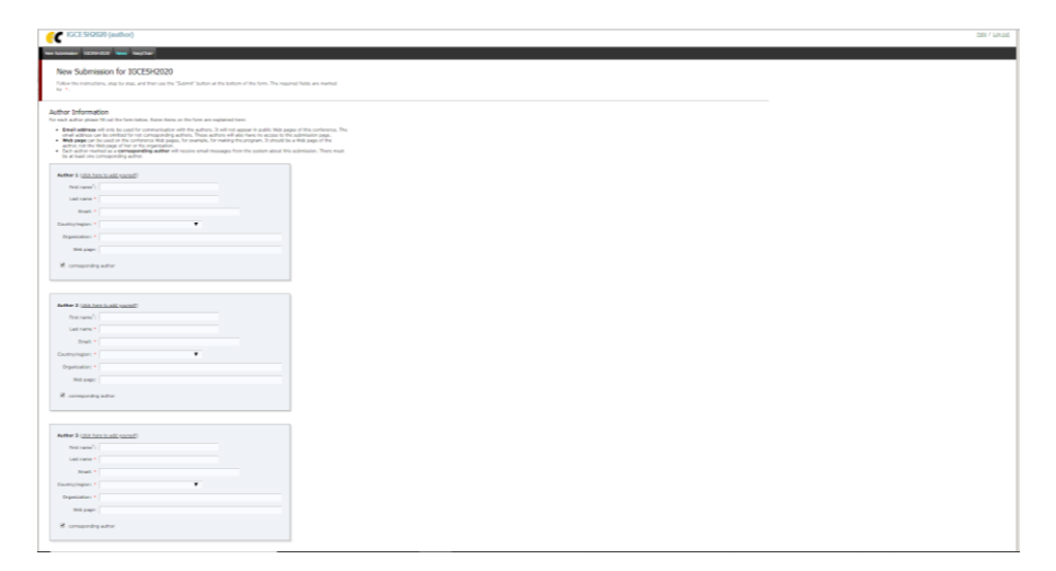
Figure 7: Authors information.

Note : You must use the same email address that you signed up with when creating the EasyChair account.